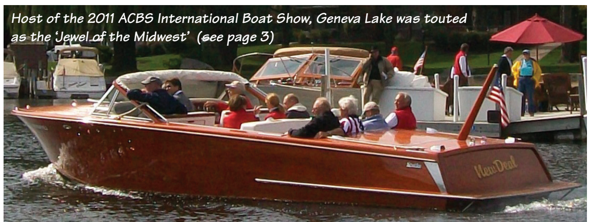
Host of the 2011 ACBS International Boat Show, Geneva Lake was touted as the 'Jewel of the Midwest' (see page 3)